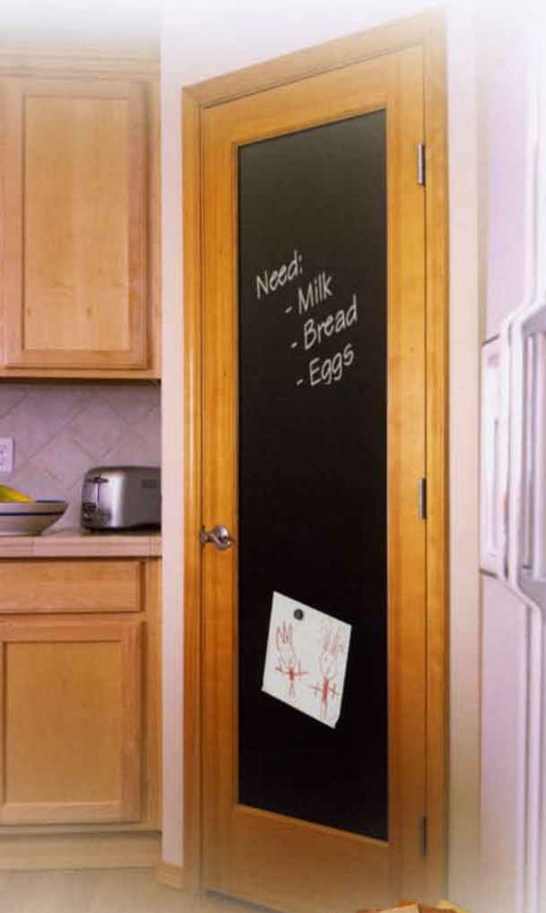
1120. Shown in Fir.